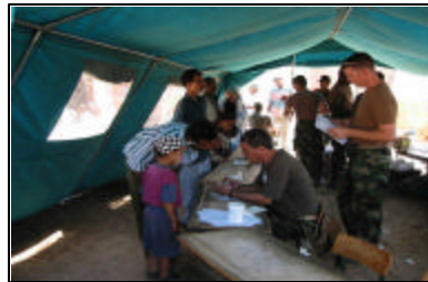
U.S. medical personnel treat Moroccan children during MedFlag 03—a USEUCOM project; over 5100 people were treated during the exercise.

The Task: EUCOM must underscore how important Africa is to U.S. national security and continually articulate the favorable cost-benefit analysis between the ends, ways and means involved in the execution of its strategy.