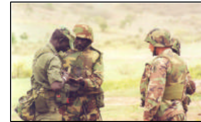
American soldiers train Senegalese soldiers during an African Crisis Response Initiative (ACRI)

program. ACOTA—Africa Contingency Operations Training Assistance—has now succeeded ACRI.