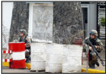
Fighting erupted near the embassy after Liberians United for Reconciliation and Democracy (LURD) rebels said they would not withdraw

from the capital until peacekeepers were deployed in Monrovia